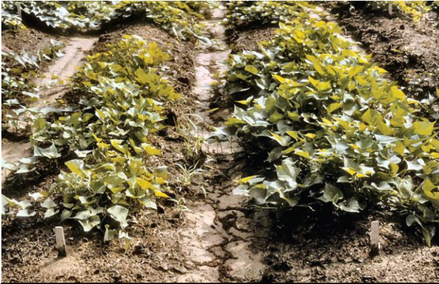
Figure 1. Reniform damage to sweet potato. Untreated left. Treated right. Louisiana State University