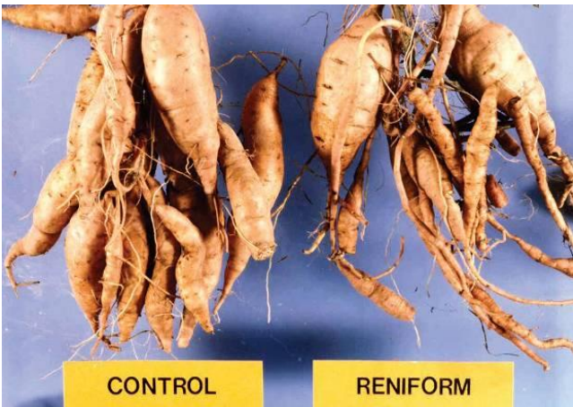
Figure 2. Poor quality infected roots right. Treated left. Louisiana State University