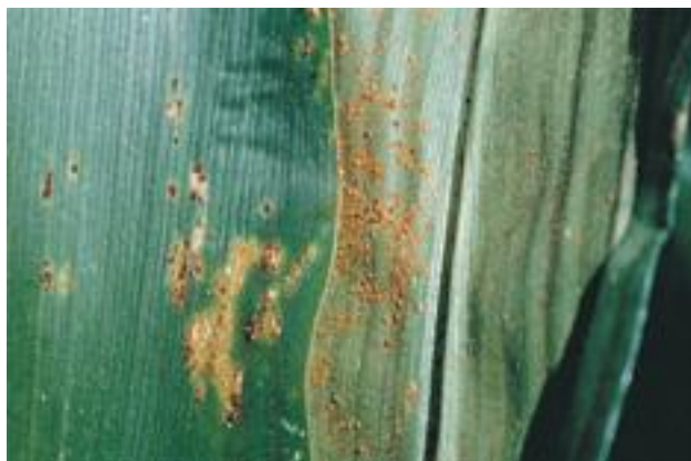
Left: Common corn rust P. sorghi , Right: Southern corn rust P. polysora .