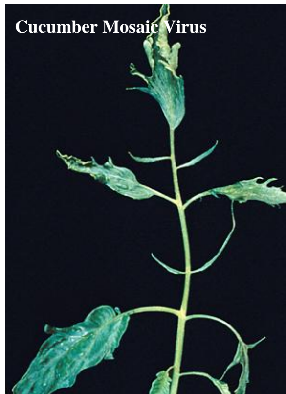
S. K. Green, APS Images