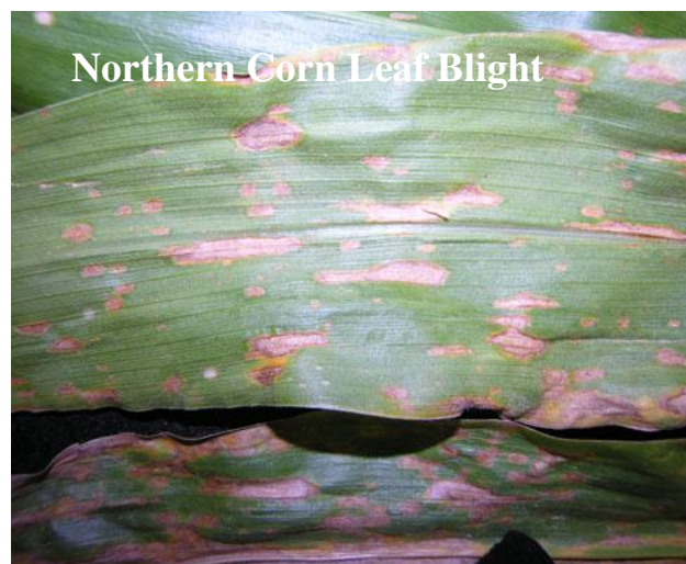
Northern Corn Leaf Blight

We're seeing quite a bit of Northern Corn Leaf Blight in the clinic now. This disease causes lesions of varying sizes depending on cultivar susceptibility. The lesions are 3-15 mm long, and start as gray green, elliptical or cigar-shaped spots. As the lesions age, they become tan with dark zones of sporulation. The disease starts on lower leaves and works its way up the plant. The disease can develop rapidly under the right conditions, completely killing the leaves. If the disease is moving up the plant towards the ear leaf, spray with fungicides once you are at plant stage 100% tassel to brown silk. Spray with propiconazole, Stratego, Quilt, Quadris, or Headline.