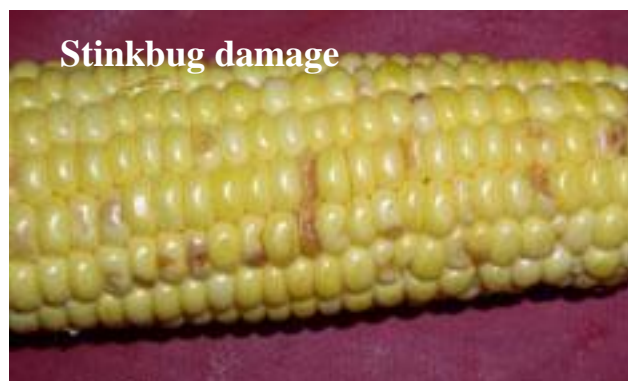
Wes Kirkpatrick University of Arkansas Cooperative Extension

Several species of stinkbug feed on corn. They pierce the husk and inject saliva into the kernels to aid in digestion and extraction of plant juices. Fresh damage appears as pinkish discolored kernels. As the ear ages, the damaged kernels become darkened and shriveled. Feeding on young leaves results in stunted plants, wrinkled leaves, pinholes, and whorl leaves failing to expand. The pinholes can expand to up to one inch in diameter, often surrounded by dead, brown tissue and a yellow halo. Heavily injured plants that are not killed by the feeding will grow new lateral tillers. Synthetic pyrethroid insecticides may be used when there is one stinkbug per five plants.