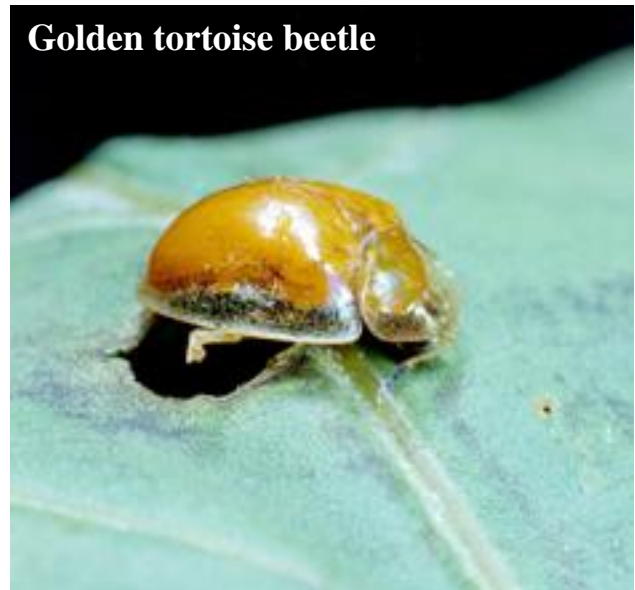
Golden tortoise beetle