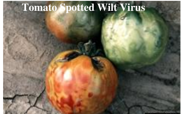
Whitney Cranshaw, http://www.forestryimages.org/