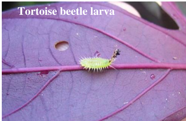
Tortoise beetle larva