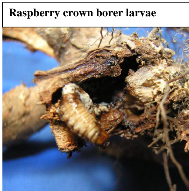
Raspberry crown borer larvae

Sherrie Smith University of Arkansas Cooperative Extension