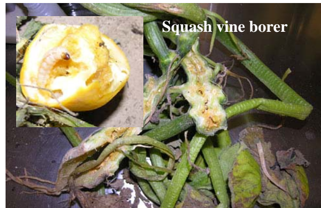
Sherrie Smith University of Arkansas Cooperative Extension

Squash vine borer Melittia satyriniformi can be a serious pest of cucurbits. The borers are the larvae of a clear-wing moth species. They over-winter as pupae or larvae in the soil, emerging in late spring as adults. Eggs are deposited singly on the underside of vines. The larvae bore into the stem where they tunnel and feed. Mature larvae exit the stems to pupate and over-winter in the soil, thus perpetuating the cycle. Symptoms are wilting, holes in the stem, and oozing. White larvae (about an inch long) with brown heads may be seen when the stems are split open. The larvae may also tunnel into the fruit. Insecticides may be applied as soon as the vines start to run, pyrethrum, rotenone, methoxychlor, malathion, or carbaryl, applied as sprays or dusts. Apply every 7-10 days for 3-5 weeks. Wilted vines should be inspected for larvae and destroyed.