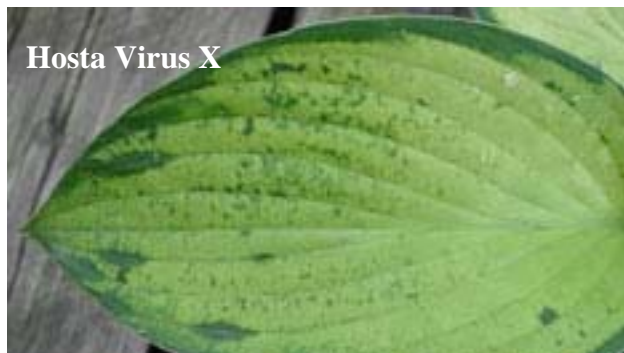
Hosta Virus X

Hostas are a favorite shade garden plant. They suffer from only a few diseases as a rule. In recent years a new virus has been identified in hosta. The virus is called Hosta Virus X (HVX). The most common symptom is blue markings or mottling on a light colored leaf, usually following the leaf veins. Leaf tissue may be puckered, lumpy, and of a different thickness than normally colored tissue. Dried brown spots and twisted deformed leaves are another symptom. Some plants will show no symptoms unless the plant becomes stressed. This virus is not soil borne or spread by insects. It is passed by sap from an infected plant to a healthy one by wounding with a tool, or by plant propagation by division of an infected plant. Some people consider the virus quite attractive and seek out plants with the blue mottling. Because this virus is at present poorly understood, some experts recommend removing any plants with symptoms from the garden. Since it is not a soil borne virus, a new hosta may be planted in the same location as long as all tissue from the infected plant is removed. As with all plant viruses there is no treatment or cure.