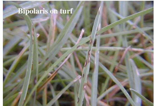
Bipolaris on turf