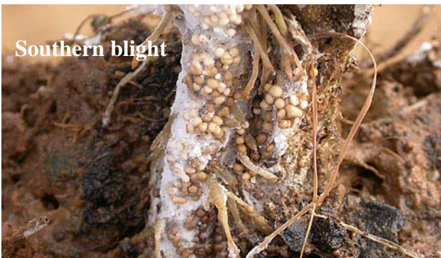
Sherrie Smith University of Arkansas Cooperative Extension

Southern blight caused by Sclerotium rolfsii is another serious disease of tomato. It causes a sudden permanent wilt of affected plants. Plants wilt while still green. The damage occurs at the soil line when the fungus girdles the stem. A large irregular brown lesion occurs there covered with a white mycelial mat. Small spherical tan to orange fruiting bodies (sclerotia) may be seen on the lesion. This disease generally occurs on scattered plants in the field. The sclerotia are viable in the soil for several years. Chemical controls are not effective as a rule. Control consists of crop rotation, deep plowing, and good sanitation. All crop residues should be removed from the field and destroyed.