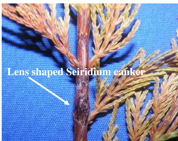
Lens shaped Seiridium canker

Bacterial spot of peach, caused by Xanthomonas campestris pv. pruni , is a persistent problem in susceptible cultivars of peach and nectarine, and plum. The disease occurs on leaves, twigs, and fruit. Leaf symptoms start as angular, grayish, water-soaked lesions, about 1-3mm in diameter. These spots are often located along the midrib, leaf tip, or both. As the spots age and enlarge, they become purple and necrotic. Often the center drops out, leaving a shot-hole effect. Many lesions on a leaf cause premature leaf drop. Lesions on twigs are called "black tip". Spring cankers start on leaf scars on twigs of the previous year's growth. Summer cankers appear on the new green twigs of the current year. Spring cankers appear as slightly raised blister-like areas that can extend a couple of mm down the twig. Summer cankers are visible by late spring or early summer. Black tip is easily seen during the winter months when the tree is leafless. Dieback is more severe on plum than peach and nectarine. Bacterial spot is difficult to control. Resistant cultivars should be used if at all possible. Autumn applications, near leaf drop, of fixed copper can reduce leaf scar infections.