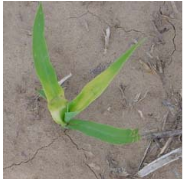
Bob Scott University of Arkansas Cooperative Extension

Non-RR corn and rice are very susceptible to early season glyphosate drift. Symptoms include: Chlorosis (yellowing), stunting and necrotic (burnt) leaf tips. Take care spraying glyphosate around young rice and corn.