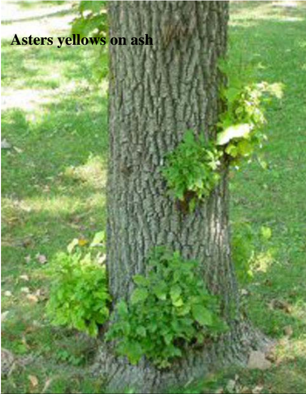
Asters yellows on ash