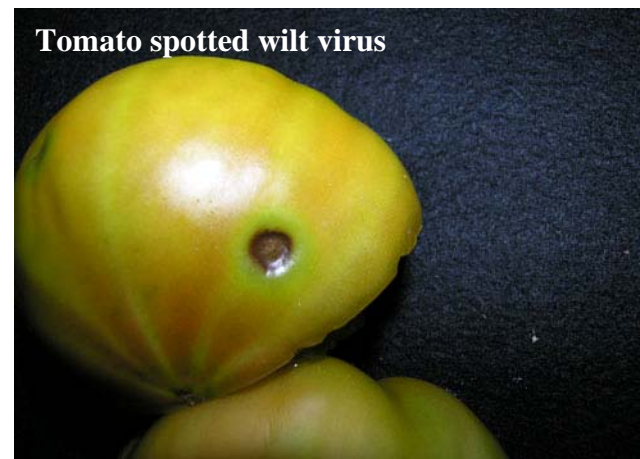
Tomato spotted wilt virus