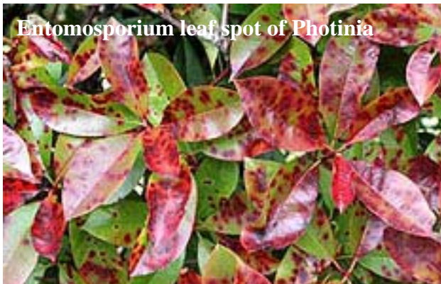
Entomosporium leaf spot of Photinia

Red tip Photinia is one of the most popular shrubs grown in the southern United States. Unfortunately, most members of this family are susceptible to Entomosporium leaf spot. Leaf spots first appear as tiny red specks on either surface of the leaf. The bright red spots may coalesce into large maroon blotches. Older spots may have gray centers with dark purple halos. Severe infections may result in heavy leaf drop and weakening or death of the plant. Cultural controls consist of avoiding overhead irrigation, improving air circulation, and cleaning up fallen leaf/stem debris. Chemical control using Daconil or Funginex is effective but sprays must be applied early and continued throughout the season.