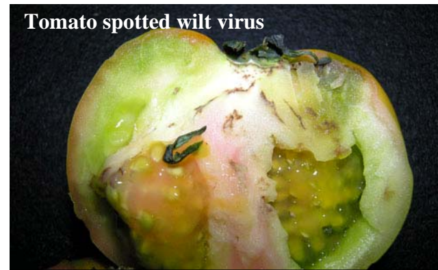
Tomato spotted wilt virus

Tomato samples continue to come in from around the state with tomato spotted wilt virus. We have discussed in an earlier newsletter the leaf symptoms which include bronzing with dark spots and terminal dieback. An interesting fruit sample came in last week. It didn't have the typical ring spotting, but had dark brown streaks and spots inside the fruit walls, with some sunken brown spots on the outside of the fruit. Since this virus is spread by thrips, infected plants should be destroyed at the first sign of symptoms.