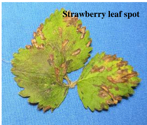
Strawberry leaf spot

Mycosphaerella leaf spot is one of the most common diseases of strawberries. It is also known as White spot, Leaf spot and Bird's-eye spot. The causal agent is the fungus Mycosphaerella fragariae . Symptoms of this disease are small, deep purple round to indefinitely shaped spots on the upper surface of the leaves. A brown to reddish-purple halo surrounds each spot. The centers of the spots change from brown to gray to white. Spots may coalesce and cause leaf death. The lesions may also develop on the fruit, stolons, petioles, and calyxes. The infection cycle is continuous, because conidia are produced throughout the season while warm wet weather persists. Control consists of using resistant cultivars when possible, and applying fungicides to susceptible cultivars. Captan, Elevate, and Switch are labeled for leaf spot on strawberry.