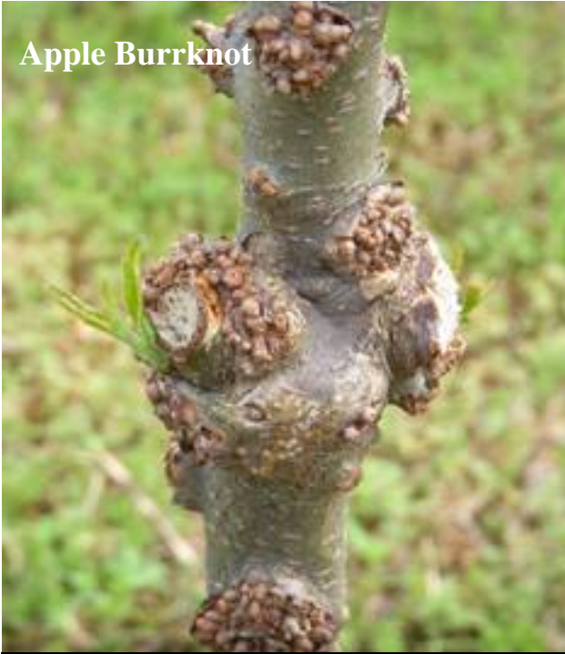
Carl E. Armstrong