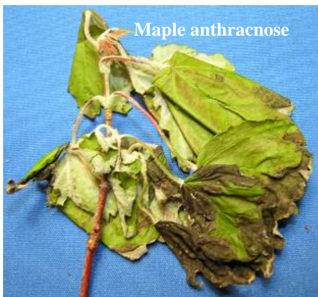
Sherrie Smith University of Arkansas Cooperative Extension

Maple anthracnose caused by Discula spp. of fungi may cause unsightly discoloration of leaves and defoliation of maples. The damage usually occurs after unusually cool, wet weather during bud break. Single attacks are seldom harmful to the tree, but yearly infections can cause reduced growth and may predispose the tree to other stresses. Symptoms include killing of the buds, twigs, leaves, and branches up to an inch in diameter. The disease causes premature leaf loss. Repeated attacks over successive years can weaken the tree and make it vulnerable to borer attack and other diseases. Good sanitation plays an important role in disease control. All fallen leaves and twigs should be raked up and disposed of. If feasible, prune out dead twigs from the canopy. Fungicides may be used if the tree is valuable. Daconil or Mancozeb should be applied at bud swell, and twice afterwards 10–14 days apart.