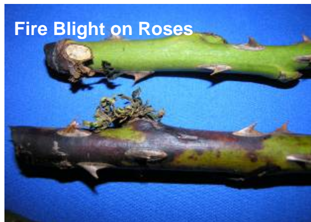
Fire Blight on Roses

The bacterium is spread by rain, birds, insects or animals, and one infected plant touching another. Gardeners can easily transmit the bacteria on infected gardening tools. The time of greatest risk is late spring to early summer. Control consists of removing infected stems and branches eight inches from the infected area. Tools should be sterilized between cuts in a 10% bleach solution (9 parts water and one part bleach), or an alcohol solution (one part alcohol to 3 parts water). Bactericides containing streptomycin sulfate are available to combat fire blight. They must be applied at bud break to be effective.