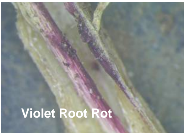
Violet Root Rot

Violet root rot caused by Heliocobasidium brebissonii is a disease of carrot, sugar beet, potato, and asparagus. This is a soilborne pathogen that spreads from plant to plant where root crops have been grown extensively. Even low levels of inoculum can cause problems. Typically, violet root rot is detected on the roots of plants with healthy foliage. Affected roots show patches of purplish-black mycelium and small dark dots of infection cushions. In severe infections, purple to white mycelial growth may be present on the crowns and on top of the soil next to affected plants. The foliage turns yellow and wilts. Dark purple mycelial growth is present on roots and crown. Soft rot symptoms often occur as secondary organisms move in. A 3-4 year rotation with non-host crops is the best control. Where soils are acidic, it's helpful to raise the soil pH to 7.0.