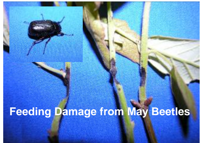
Feeding Damage from May Beetles

May beetles feed on the foliage of various trees and shrubs at night, with oak being the preferred host for many species. The foliar feeding by adult beetles is annoying, but rarely causes significant damage. The primary damage is larval feeding on the roots of turf, young trees, and shrubs. The grubs are large, fat curled white grubs you may find when digging in your lawn or garden. There are over 200 species of this type of beetle. The eggs are laid in the soil in the spring. Larvae feed for a limited amount of time before migrating downward during the winter. The second season, they return to feed on roots, doing most damage as they grow in size and weight. At the end of the third year, they pupate and emerge from the ground as adults in the spring to feed on foliage and mate. In the southern United States, many species complete their life cycles in one year. Control is achieved by applying a season-long grub control to the lawn and flower beds.