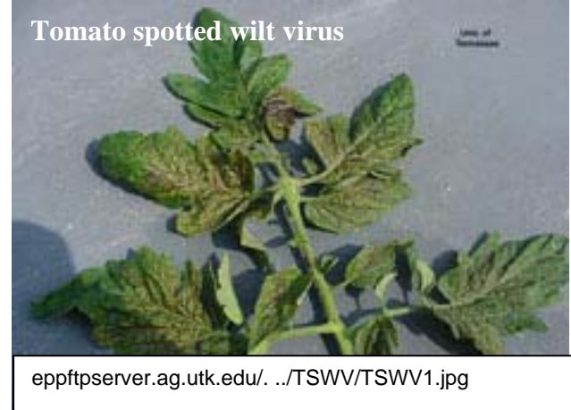
Tomato spotted wilt virus