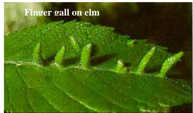
Finger gall on elm

http://www.extension.umn.edu/distribution/horticulture/components/DG1009fig02.html