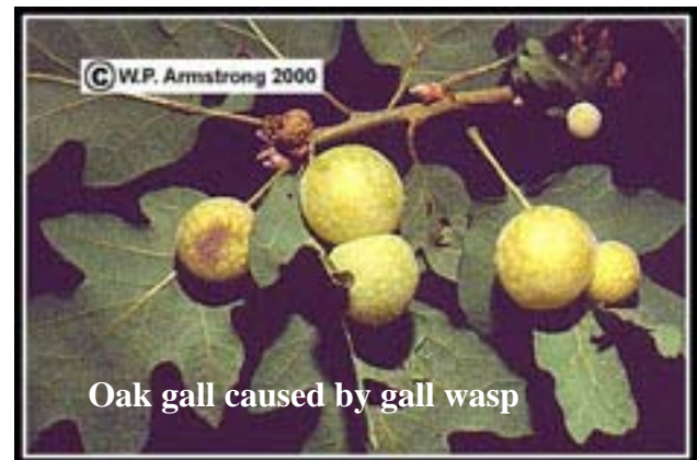
Oak gall caused by gall wasp

Texas agricultural extension http://entowww.tamu.edu/extension/bulletins/L-1299.html