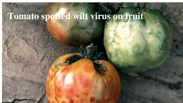
Tomato spotted wilt virus on fruit

eppftpservers.ag.utk.edu/.../TSWV/TSWV1.jpg