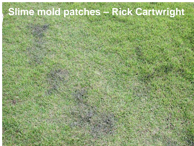
Slime mold patches - Rick Cartwright