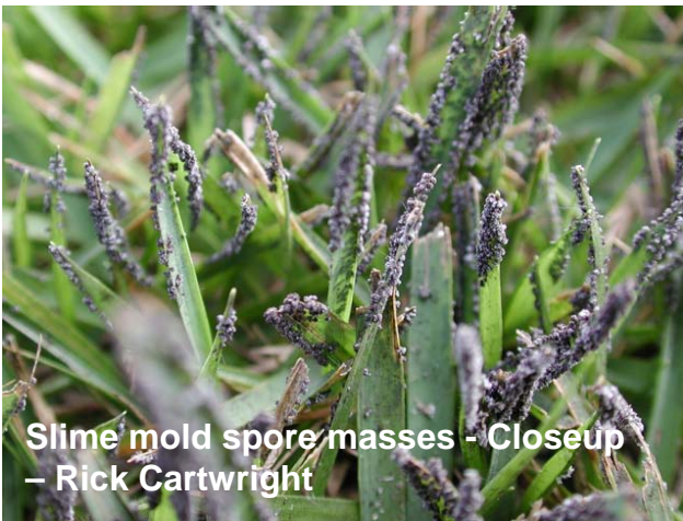
Slime mold spore masses - Closeup - Rick Cartwright

have eaten enough bacteria, they congregate into many small "slugs" which crawl up onto grass blades and form a stalk with spores on top (closeup photo). The spores are then spread around by splashing water, wind or mechanical movement (mowers, walking). Slime molds are a natural part of the environment and are not harmful. If unsightly, you can simply wash them away with a garden hose.