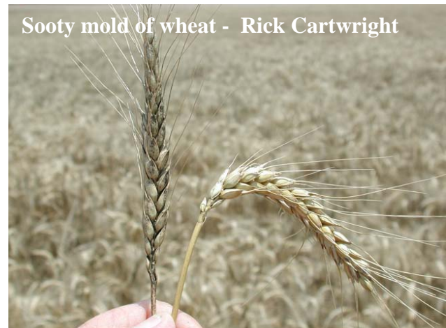
Sooty mold of wheat - Rick Cartwright

We are seeing the first evidence of sooty mold on wheat heads that have been prematurely killed by spring freeze injury, barley yellow dwarf and other conditions. When a wheat tiller is prematurely killed by "whatever" in the spring, the carbohydrates that should have gone into the grain become available to various fungi that naturally live on the surface of the plant. These "saprophytic" fungi grow rapidly on the killed heads, consuming the unused carbohydrates and most of these fungi produce abundant, dark spores – thus the term sooty mold (photo). There is no recommended control since these fungi do not affect living, healthy wheat.