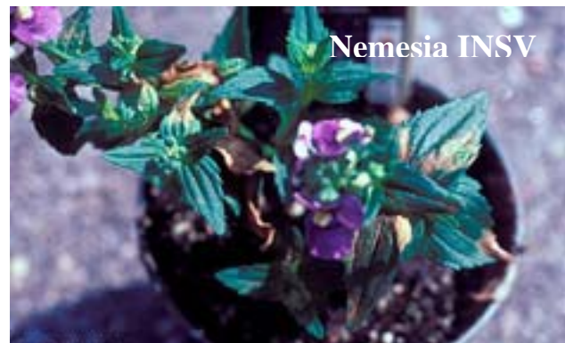
L. Pundt, UConn www.negreenhouseupdate.info

Nemesia are popular annual bedding plants. They are compact, bushy plants 8–12 inches tall, and are available in a wide range of colors, both solid and bi-colors. In addition, they tolerate half a day of shade as well as full sun. It is unfortunate that Nemesia is one of many species susceptible to Impatiens Necrotic Spot Virus (INSV). INSV was formerly known as the I strain of Tomato Spotted Wilt Virus. It has recently been confirmed as being a separate virus. INSV attacks many of our most popular greenhouse grown plants. The vector is the western flower thrip, Frankliniella occidentalis . Symptoms are stunting, wilting, and brown, black, or purple ring spots on leaves and stems, and