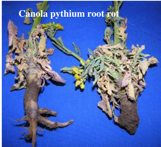
Canola pythium root rot

Both Pythium and Phytophthora species can attack the roots and crowns of canola when soil conditions are right for infection. Heavy soils and poor drainage provide optimum conditions for root diseases caused by this group of pathogens. Above-ground symptoms are wilting, yellowing, and stunting. Root symptoms are blackening and rot of both feeder roots and taproots. Often the plant can be easily pulled from the ground because there are no roots left to anchor it. Control consists mostly of improving drainage and not planting in fields with a history of the disease.