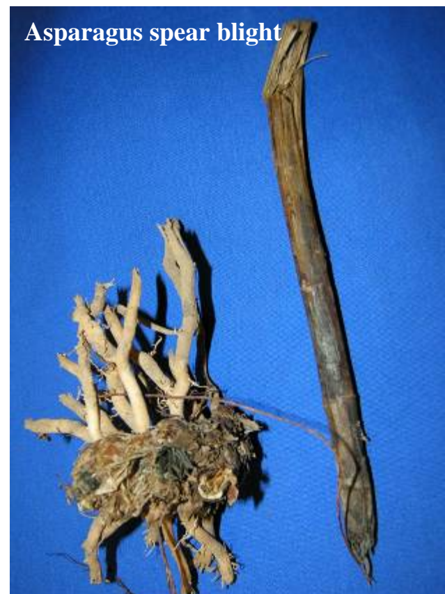
Asparagus spear blight

Asparagus is a favorite spring vegetable wherever it is grown. It is now available year-round in U.S. markets. Asparagus spear rot caused by Phytophthora megasperma is a serious problem in warmer areas of the U.S. Symptoms of the disease are soft water soaked spots on the spears slightly above or below the soil line. The lesions expand as they age, eventually collapsing and shriveling. This collapse causes the spear to bend like a shepherd's crook. The internal tissues become discolored, turning from brown to black as the crown rots. The extent of the damage depends on rainfall and soil drainage. Mefenoxam is effective but must be used cautiously in order to avoid promoting resistant strains.