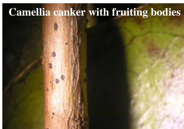
Camellia canker with fruiting bodies

Another common problem on camellia is scale. Several species attack camellia. The most common is tea scale, Fiorinia theae . The introduction of ornamental camellias from Asia into the United States is thought to be responsible for introducing the pest. It also attacks tea, holly, citrus, dogwood, bottlebrush, kumquat, mango, and olive. Symptoms include yellowing of the upper leaf surface, leaf drop, twig dieback, and occasionally death. Hand picking infected leaves is effective if there are only a few leaves involved. The best time to spray is in the spring after blooming with fine horticultural oil. Spray two applications, 10 days apart. Insecticides such as Malathion and seven will kill crawlers, but have the disadvantage of killing beneficial insects as well. Healthy plants attract fewer insects, so the key is to make sure your camellias are planted in the right location with adequate water and nutrients.