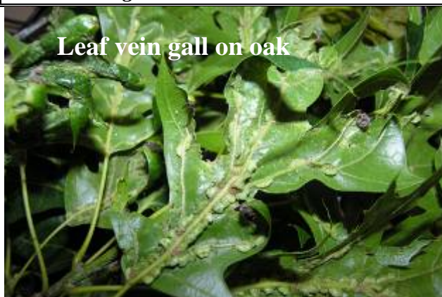
Leaf vein gall on oak