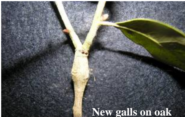
New galls on oak