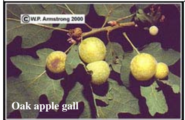
Oak apple gall