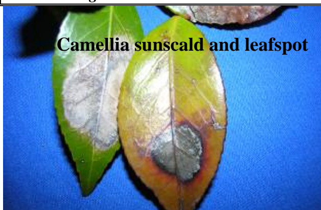
Camellia sunscald and leafspot