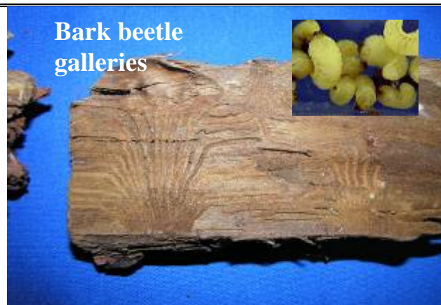
Bark beetle galleries