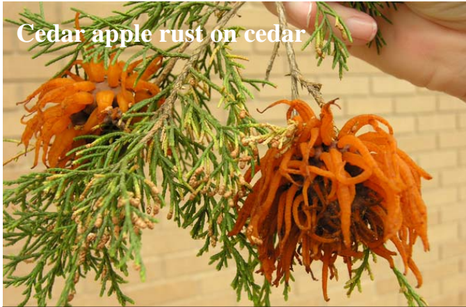
Cedar apple rust on cedar