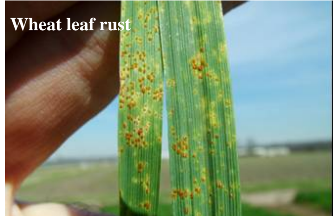
Wheat leaf rust