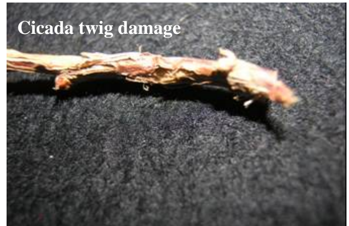
Cicada twig damage