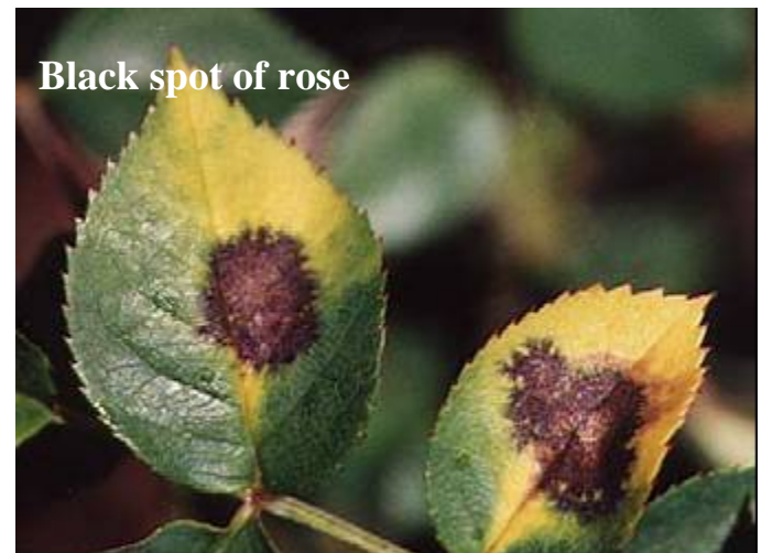
Black spot of rose

http://members.tripod.com/sactorose/irosepests.html#