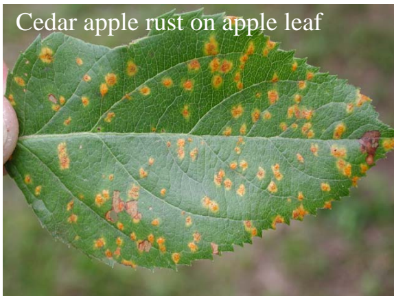
Cedar apple rust on apple leaf

Special airborne spores form on these horns, and blow to nearby apple trees, where they can infect leaves and fruit – causing unsightly spots (photo). The fungus spends the summer on apples, and then in the fall produces spores that again infect cedar twigs – completing the life cycle for this complex fungus. Cedar apple rust can be controlled with preventative fungicide sprays before noticeable infection of leaves has occurred. Refer to the MP 154 or contact the local county extension office for more information.