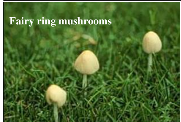
Fairy ring mushrooms