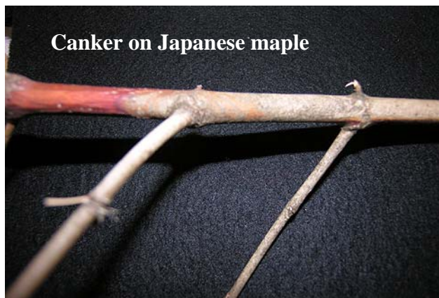
Canker on Japanese maple

Japanese maples are much loved favorites in the perennial garden. Their year round beauty, versatility, and variety have made them admired around the world for centuries. What limits their use in the southeastern United States is their intolerance to high summer temperatures. In spite of that limitation, some cultivars such as Bloodgood and Coral Bark do well in our environment. Planting location is essential to success with these lovely trees. In their native habitat Japanese maples are an understory tree. They like moist, leafy soil in a semi-shaded location, with protection from damaging winter winds. They cannot tolerate drought, over-watering, or heavy clay like soils. Stressed trees are prone to leaf scorch and canker diseases caused by several pathogens. We have isolated Colletotrichum , Phomopsis , Nectria , and Botryosphaeria from branch and twig cankers. The cankered areas will look gray or tan against the normal reddish brown color of the twigs. Small black fruiting bodies of the fungus may be seen with a hand lens. Trees should be checked carefully each spring for diseased branches which should be pruned out and destroyed. Japanese maples benefit from being fertilized with a tree and shrub food once in the spring and again in the fall.