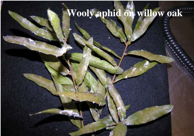
Woolly aphid on willow oak

insecticidal soaps, or malathion. Spraying mature oaks is not practical for most homeowners.