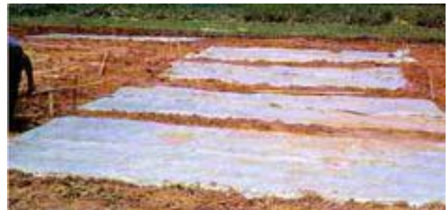
Figure 2. Soil solarization.