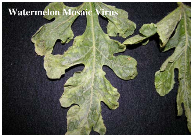
Watermelon Mosaic Virus

Several viruses affect melons. Watermelon mosaic virus (WMV) affects cucurbits, peas, vetch, clover, and alfalfa. It is found wherever cucurbits are grown. Symptoms vary according to species, cultivar, and environmental conditions. Plants may be stunted. Leaves may be malformed, mottled green and yellow and blistered. Rugose leaves and vein banding may also occur. Fruits can be misshapen, dwarfed, mottled, or spotted. WMV overwinters mostly in wild legumes and is spread to cultivated cucurbits by more than 20 aphid species. There is no evidence it is seedborne. Aphid management and the use of resistant cultivars are the recommended control measures.