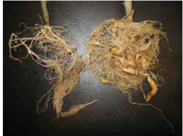
Figure 1. Root-knot galling.

None of the methods discussed in this article will eliminate the root-knot nematode, but they will help ensure that the home gardener can continue to produce a consistent and rewarding harvest.