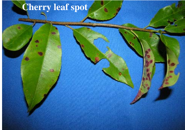
Sherrie Smith University of Arkansas Cooperative Extension

serious disease causing extensive defoliation, yield reduction, and overall weakening of the trees. Small purple spots appear on the leaves 3-6mm in diameter. White spore masses develop on the under surfaces of the leaves after heavy dews or rains. In severe cases trees may become nearly defoliated as affected leaves turn yellow and fall prematurely. Fallen leaves should be rakes up and destroyed to reduce inoculum the following season. Fungicides applied starting just after bloom and continued throughout the season give good protection. Myclobutanil, chlorothalonil, and captan are recommended fungicides. See MP 154 for a complete list.