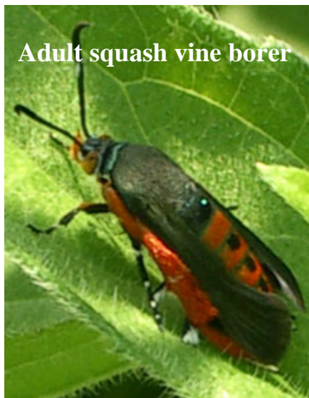
Adult squash vine borer