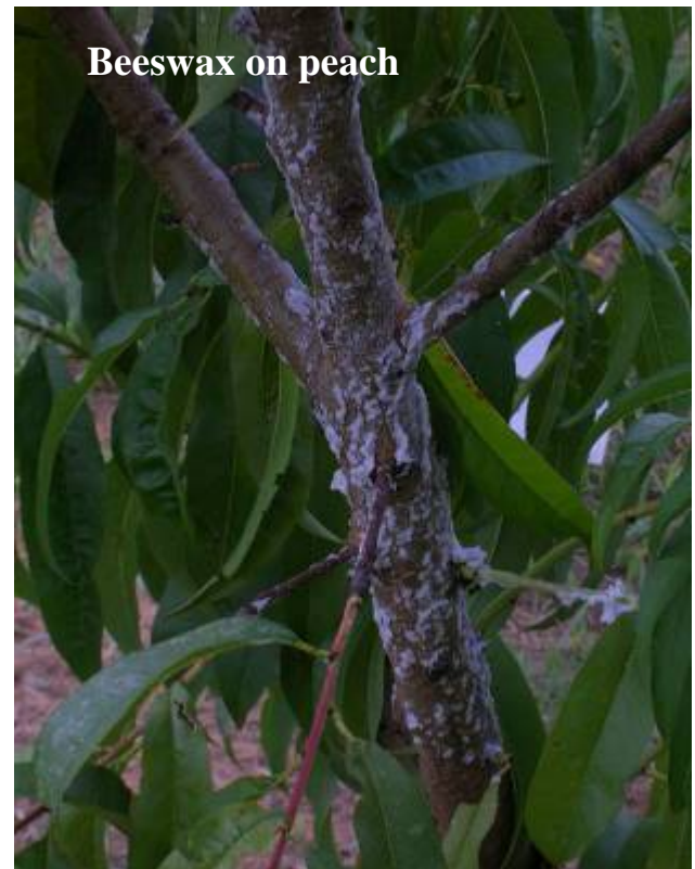
Beeswax on peach