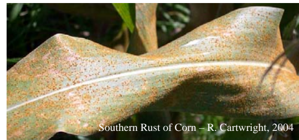
Southern Rust of Corn – R. Cartwright, 2004