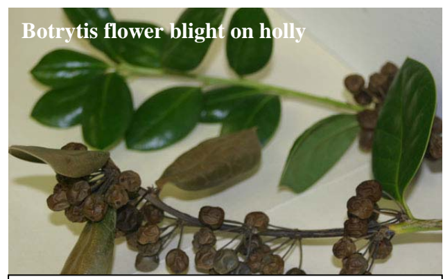
Botrytis flower blight on holly

Hollies can also contract fungal leaf spot diseases. These are usually minor problems requiring nothing more than a general purpose fungicide such as chlorothalonil, and clean-up old leaves, etc. When the fungus attacks flower buds in the spring you may see a blighting of the berries and stem dieback. Affected stems should be pruned out and discarded.