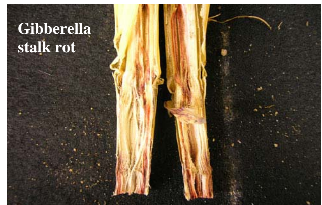
Sherrie Smith University of Arkansas Cooperative Extension

green, lower stalks become straw colored, and plants wilt. The internal pith becomes shredded and disintegrates, leaving only the vascular bundles. A diagnostic sign of this disease is the reddish discoloration that occurs inside the stalk. Another symptom is the superficial round black perithecia that can be scraped from the stalk surface. These are found most often at the internodes. Other symptoms are stalk breakage, lodging, and premature death of the plant. Good resistance is available, but often takes a backseat to yield in hybrid selection. Deep plowing and rotation are useful cultural controls. Maintaining good soil fertility, especially with regards to potassium, and proper irrigation are also very important in minimizing stalk rots. Finally, leaf health during grain fill is important to maintaining stalk integrity because modern hybrids will use stalk energy reserves to complete grain fill if leaves should die prematurely. Southern rust, although rarely, can cause enough premature leaf death to result in increased stalk rots and lodging – as seen in 2004 in parts of the state. This foliar disease should be controlled with fungicides should it appear prior to the denting stage of corn.