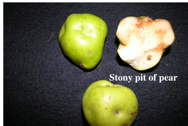
Stony pit of pear

Pears are susceptible to a number of viruses. Stony pit is one of the most destructive because the deformed fruit is unmarketable. Dark green areas form on the small fruit 10-20 days after petal fall. The fruit becomes pitted and deformed due to restricted cell growth in those areas. The tissue at the bottom of the pits is often necrotic and difficult to cut. Areas inside the fruit may be necrotic. Some fruit may be undersized and completely deformed, others may have only a single pit, and others appear completely normal. Symptoms may appear on one side of the tree only or all over the tree. A tree may be affected one year and have no symptoms the following year. No causal agent has been identified, but it is believed that the virus is spread mechanically by budding, grafting, and rooting of cuttings. Pits in fruit may be produced by other causes such as cold injury to blooms, insect stings, and boron deficiency. These deformities are not associated with production of abnormal sclerenchyma cells which is a symptom of stony pit. There is no treatment for this virus. Afflicted trees should be kept well-watered, fertilized properly, and other pests and diseases controlled to help reduce stress and minimize the impact of the disease.