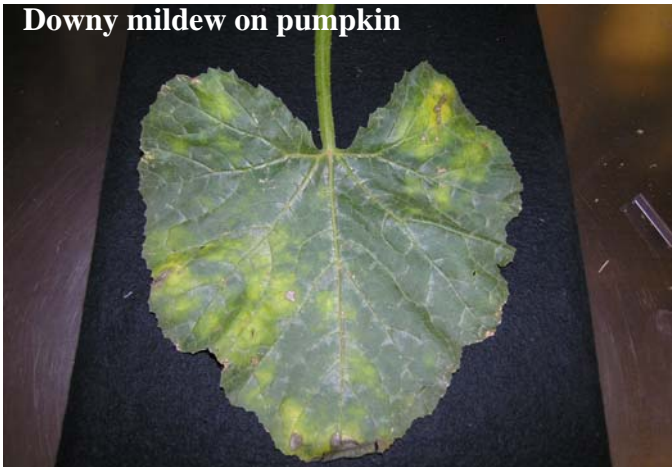
Downy mildew on pumpkin