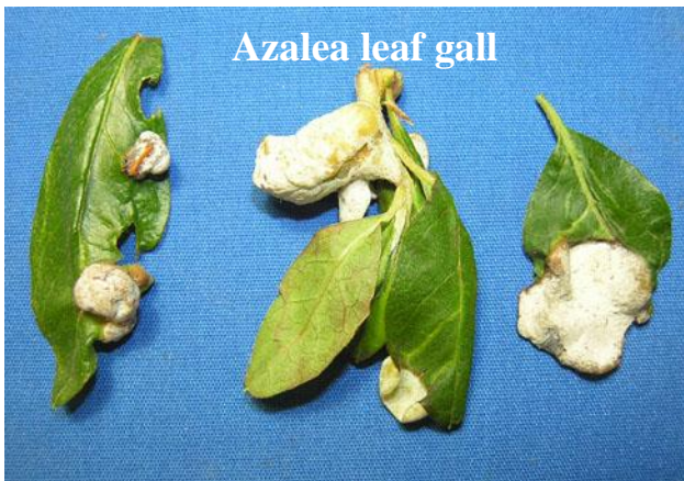
Sherrie Smith University of Arkansas Cooperative Extension

Redbud is a beautiful spring-flowering tree native to the eastern United States. The heart shaped leaves and lovely rosy pink flowers make it a favorite throughout its range. It prefers moist well drained soils and some afternoon shade. Redbuds are a short-lived tree, starting to decline after about 20 years, usually due to cankers and insect problems. Even young healthy Redbuds can be attacked by Eriophyid mites. Eriophyids belong to the genera of mites called gall mites. They are tiny, microscopic mites, yellowish to pinkish-white to purple in color. Unlike other mites, they have only two pairs of legs and are worm-like. They attack a wide range of plants, including many trees and shrubs. There are several generations per year. Adults overwinter in cracks in bark. Gall development is initiated as adults feed on developing buds in spring. The female becomes enclosed in the abnormal growth, and lays eggs within. Eggs hatch and mites reach adulthood, leave the galls and are carried by the wind to new hosts, or remain on the plant to make additional galls. The galls don't usually cause severe damage to the host plant. Controls consist of removing affected leaves and branches and destroying them if practical. Miticides applied in the spring at bud swell can help control the amount of damage.