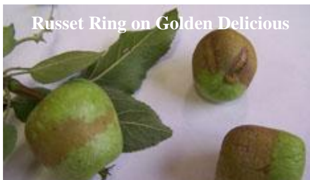
Russet Ring on Golden Delicious

The tree had blossomed early and the frosts burned the buds, resulting in a superficial Russet Ring around the mature fruit's skin. This does not usually affect fruit quality except in severely burned flowers. There is another condition known as Russet Ring caused by a graft transmitted virus or virus-like organism. It causes similar looking blotches and scarring. Fruit, however, does not ripen properly, remain small and hard, and taste bad.