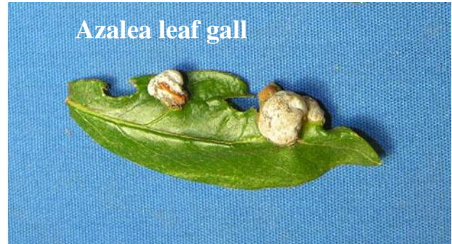
Sherrie Smith University of Arkansas Cooperative Extension

Each year Arkansas gardeners are startled upon finding bizarre growths on azalea leaves in their gardens. These are leaf galls caused by the fungus Exobasidium vacinii . The disease is especially prevalent during cool wet springs. The galls only occur on tender new growth. The plants are safe from infection once new foliage has hardened. Symptoms are thickened, fleshy, distorted areas on new leaves. The galls are pinkish to white, eventually turning brown. Azalea leaf gall does not seriously impact plant health, but is an unsightly nuisance. The best control is picking the galls off as soon as they appear and removing them from the garden. Leaving them on the shrub allows inoculum levels to increase and infect new leaves the following spring. Fungicides may be applied at the first sign of new growth in the spring and continued until for several weeks until new growth has hardened and become non-susceptible. Daconil or Rose sprays are sufficient.