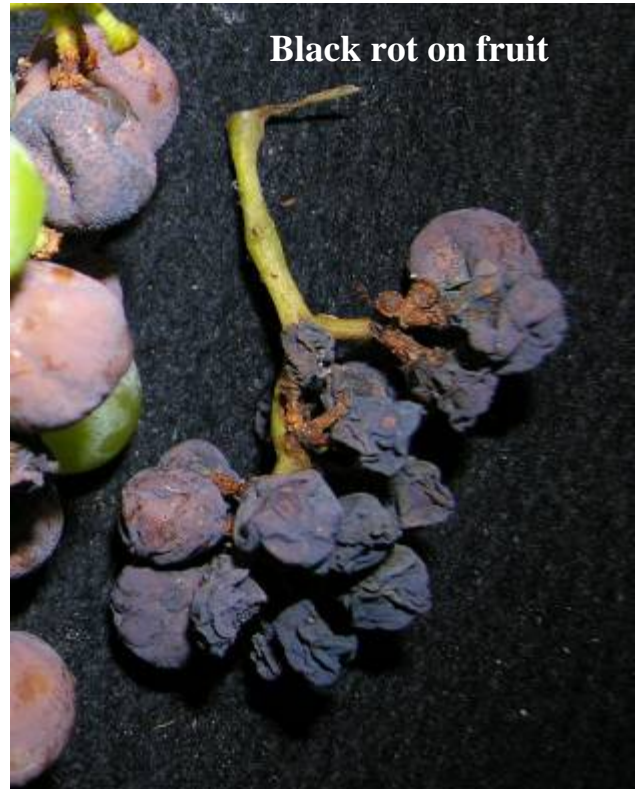
Black rot on fruit