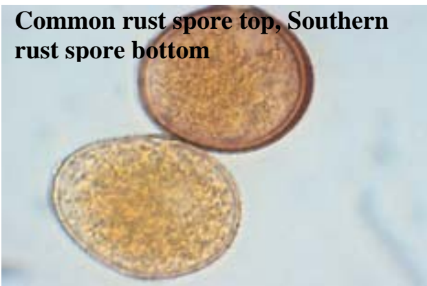
Common rust spore top, Southern rust spore bottom

common rust. Unlike common rust, Southern rust develops primarily on the upper surface of the leaf. Southern rust can cause serious yield losses as heavily infected leaves are killed. There are resistant hybrids available. Fungicides labeled for rust control in Arkansas are Tilt, Quilt, Propimax, Stratego, and Headline. Quadris is labeled for common rust, but not Southern rust. The clinic has received a number of samples with common rust, but we have not had any Southern rust samples yet.