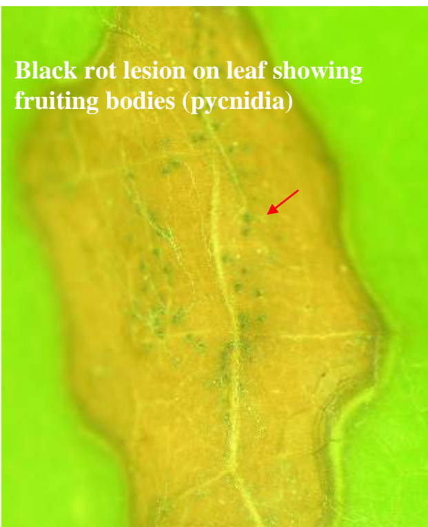
Black rot lesion on leaf showing fruiting bodies (pycnidia)

Sherrie Smith University of Arkansas Cooperative Extension