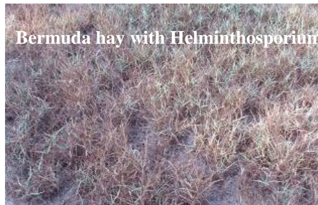
Bermuda hay with Helminthosporium