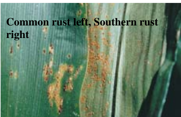
Common rust left, Southern rust right