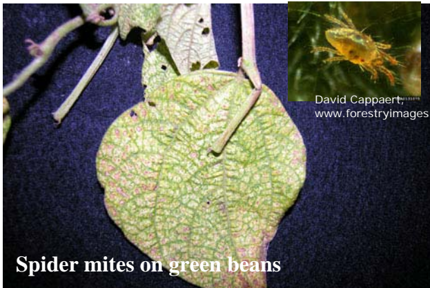
Spider mites on green beans

premature leaf drop and plant death. Looking at the underside of symptomatic leaves with a hand lens will show the tiny mites, their eggs, and webs. Insecticides are of little use against mites. A miticide must be used when seeking a chemical solution. Most miticides do not kill the eggs and must be repeated at 10-14 day intervals. Insecticidal soaps and fine horticultural oils can also be used to good effect. A strong stream of water will wash them off foliage. All treatments must be repeated to kill newly hatching young. Over use of insecticides in the garden can encourage outbreaks of spider mites by eliminating their natural predators? Drought conditions also encourage mite infestations. Watering plants properly can reduce incidence.