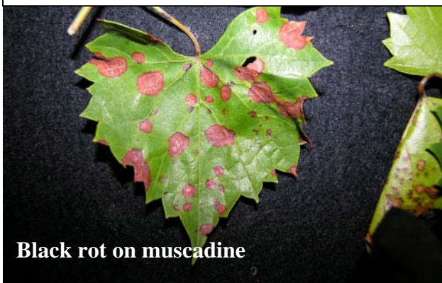
Black rot on muscadine