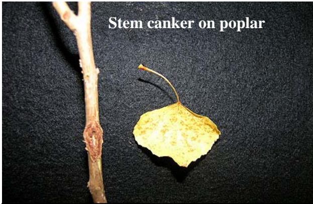
Stem canker on poplar