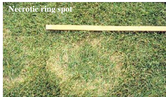
Necrotic ring spot

Note the dieback at the top of these poplars.