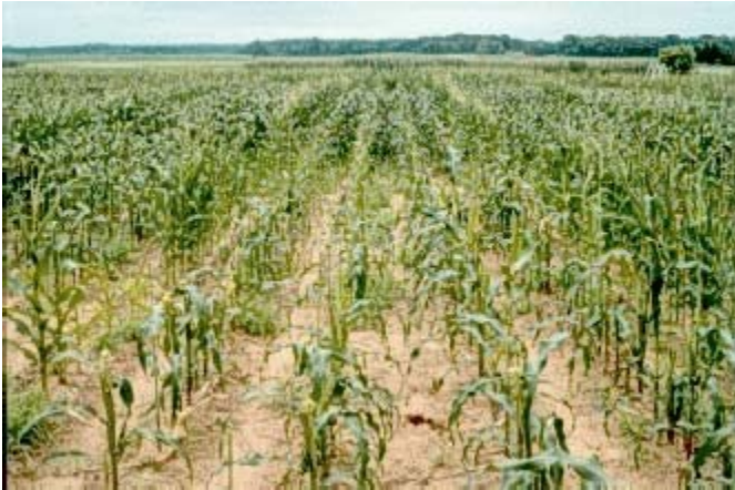
Figure1. Lesion Nematode on Corn