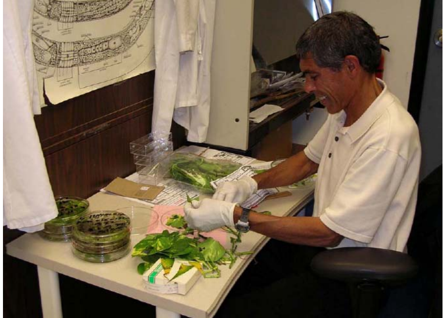
Submitted by Musa Abdelshife

Currently, he is working on an unknown group of fungi belonging to Coelomycetes, Ascomycetes, and Basidiomycetes fungi intercepted on propagated plant shipments imported from Korea, China, Vietnam, and New Zealand to California. The infected plant shipments with actionable plant pathogen will be re-exported to the country of origin or destroyed.