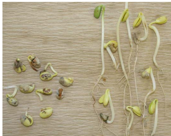
Standard germination testing show soybean seed with poor germination, left, and good germination, right.

"And we're not just looking for stand failures. Knowing what seed came up perfectly for a great stand is just as important."