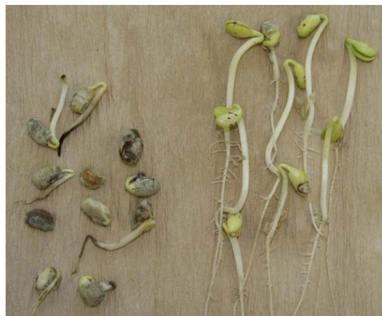
Accelerated aging test . Poor accelerated aging, left, versus good accelerated aging, right.